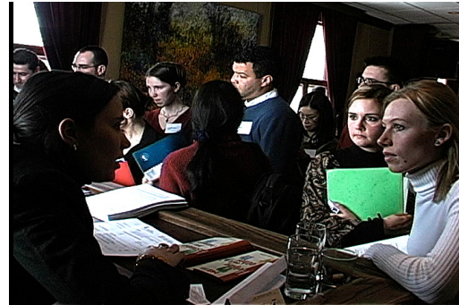
Montreal Career Fair 2003

Kids Help Phone - WUSC – World Education Services – SHARE – SPUD – CEI – Canadian Nature Federation – United Way Regina – CECI – Canadian Human Rights Foundation – Santropol Roulant