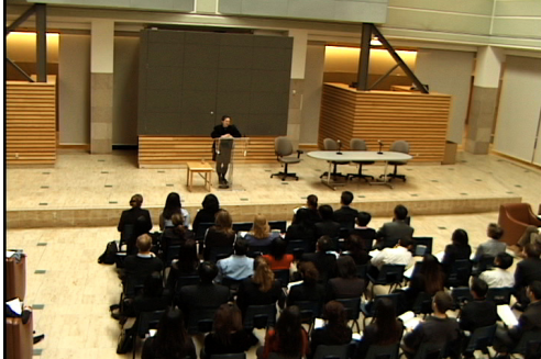
Toronto Career Fair 2003

The Toronto event was attended by just over 100 students, from Schulich and Rotman.